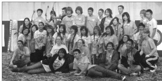
The Archery Team poses for a group picture after the state competition.

The team has earned the right to compete for the National Championship in Louisville, Kentucky on May 7 th and 8 th . Good luck and congratulations Coyotes!