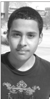
Jonathan Cervantes Design Academy